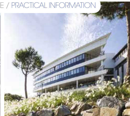
Left to right : CHU d'Amiens – Centre Antoine Lacassagne, Centre de lutte contre le cancer de Nice – Institut de Cancérologie de l'Ouest, Nantes