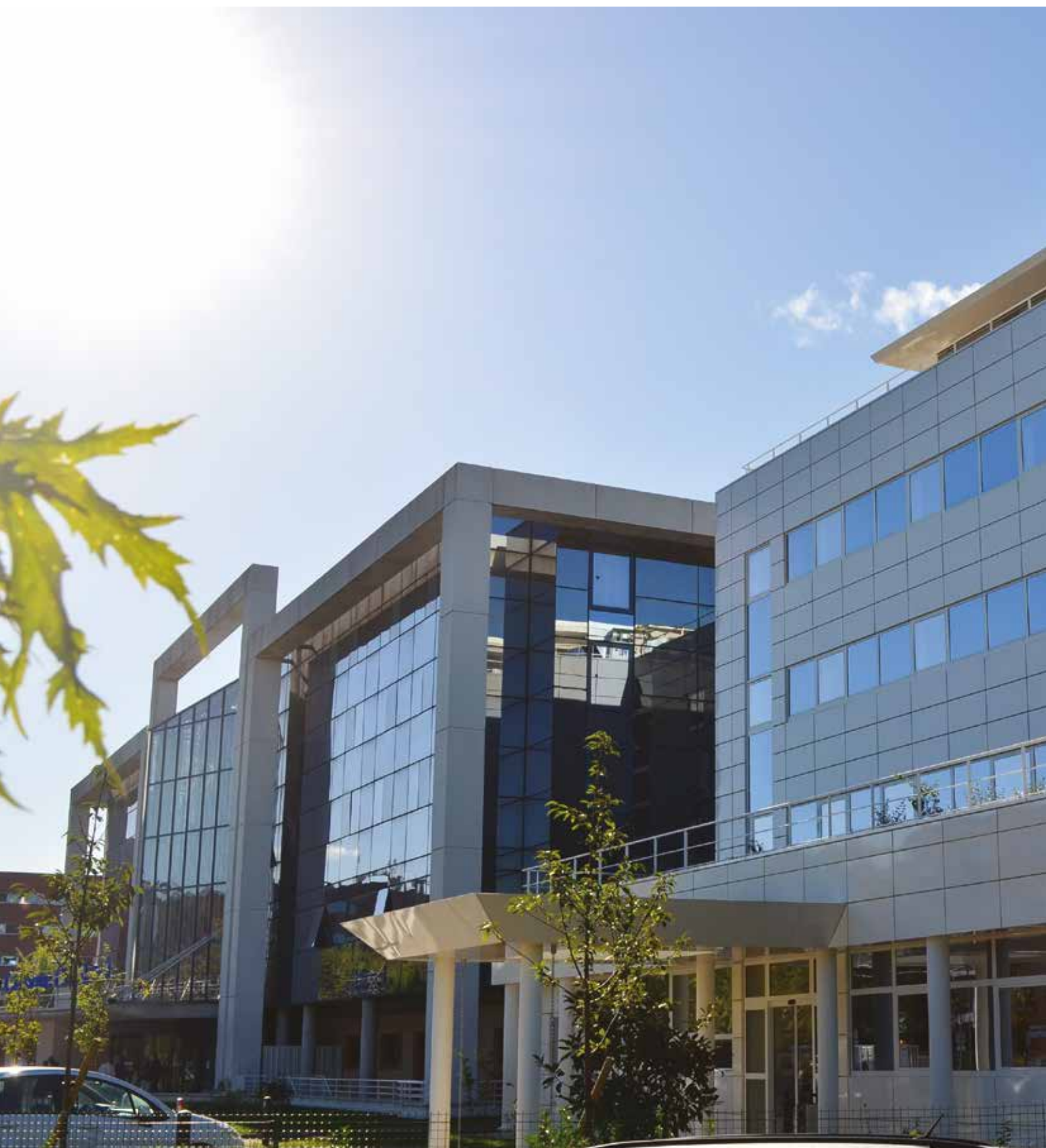
Clinique Claude Bernard, Ermont