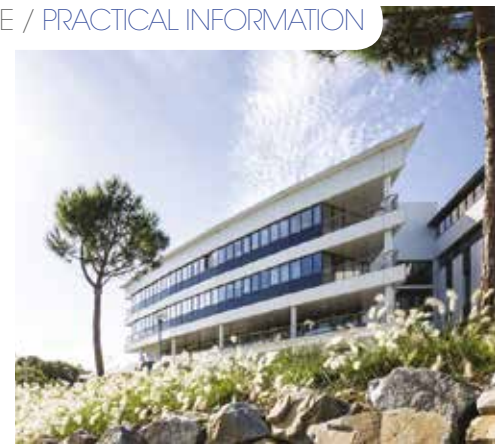
Left to right : CHU d'Amiens – Centre Antoine Lacassagne, Centre de lutte contre le cancer de Nice – Institut de Cancérologie de l'Ouest, Nantes